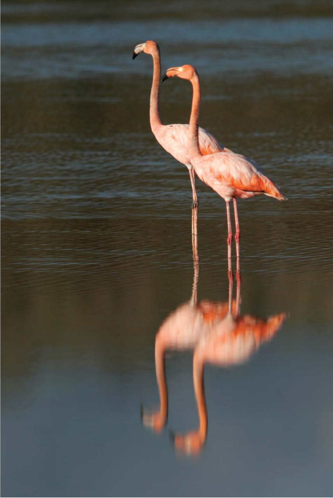
Pink flamingos. Punta Cormorant, Floreana. Day 10, Saturday 30 April, 7:12AM.