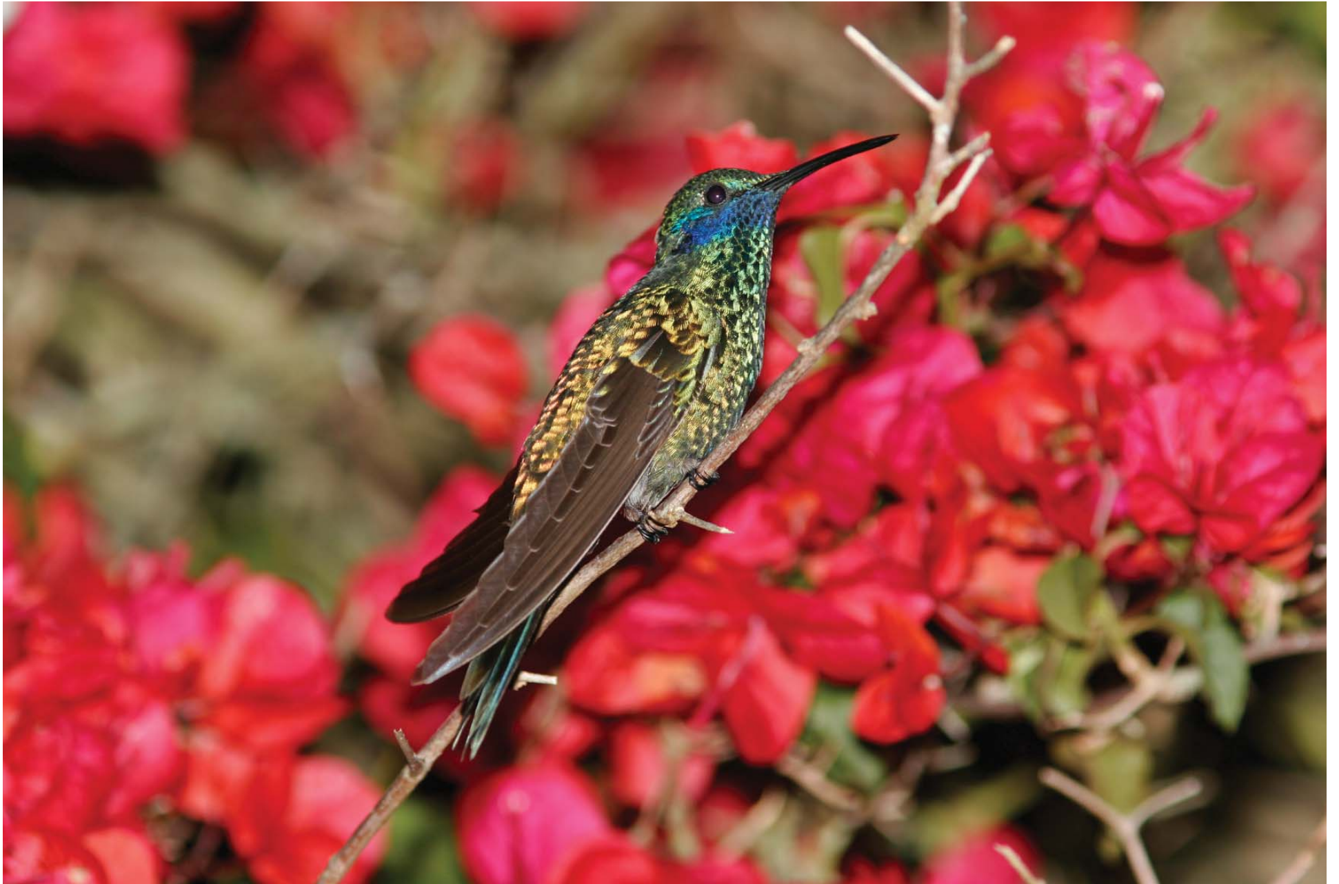
Sparkling violetear. Hacienda Zuleta. Day 5, Tuesday 25 April, 6:02PM.