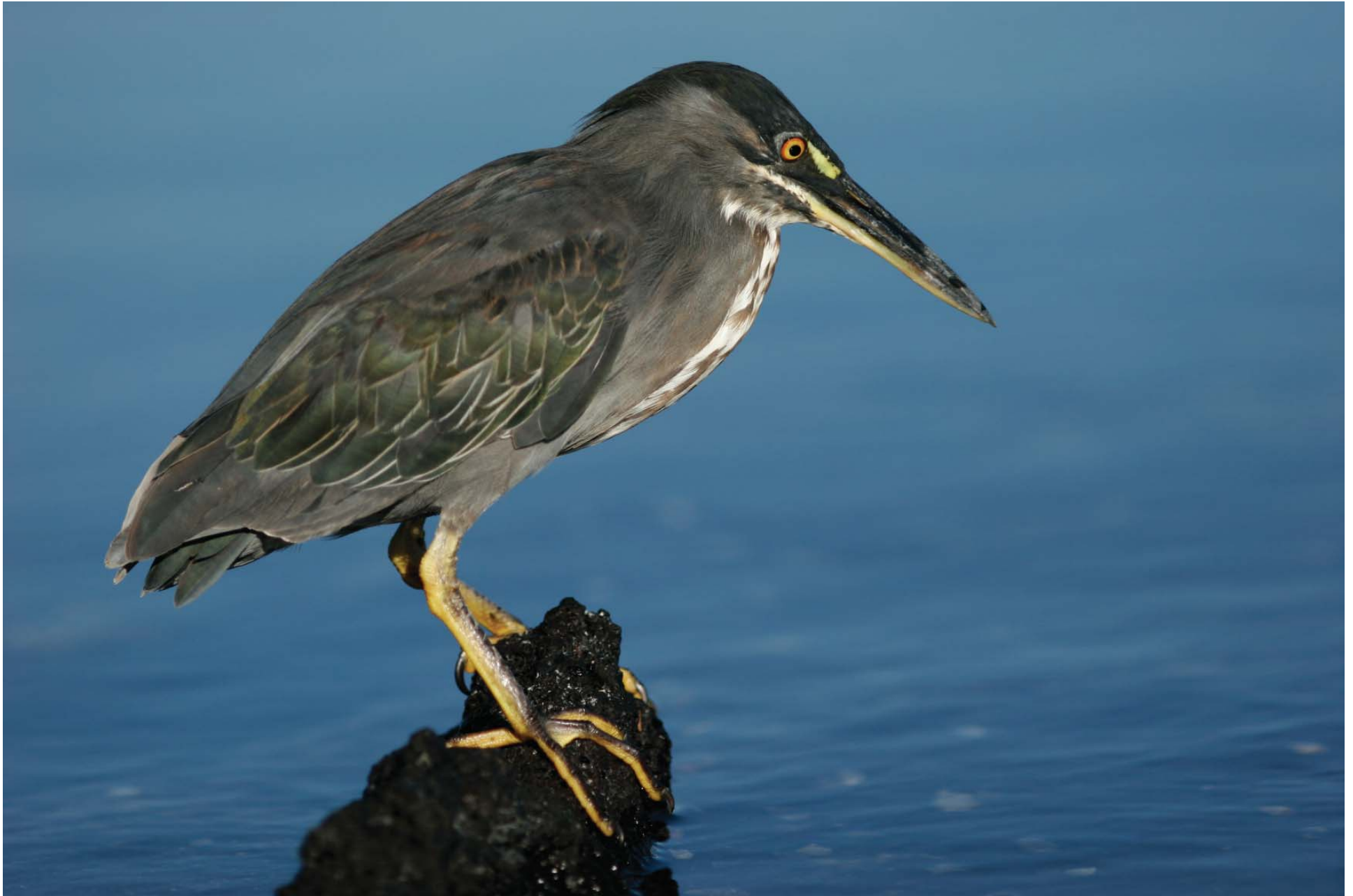
Lava heron. Punta Espinosa, Ferndandina. Day 12, Monday 2 May, 4:30PM.