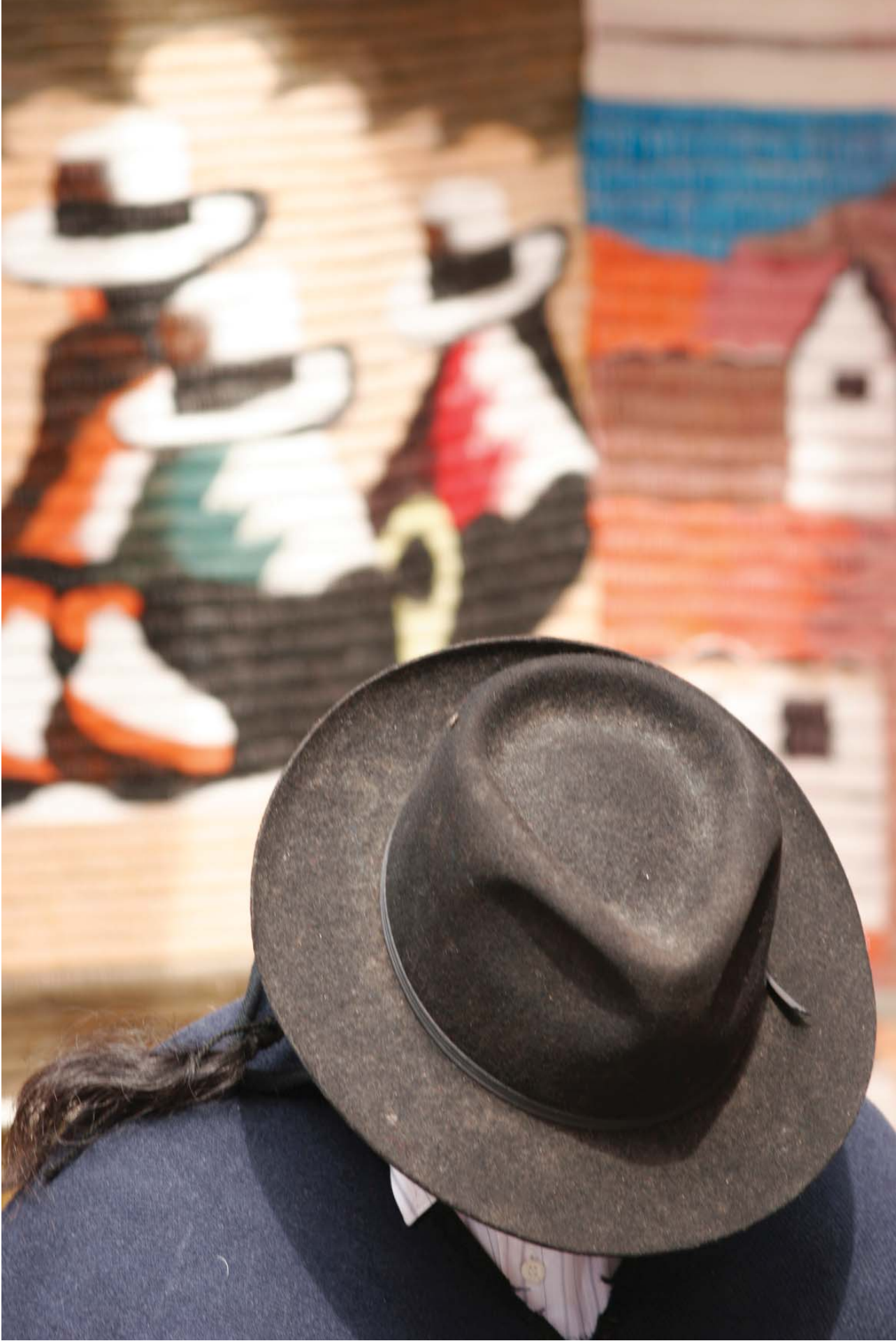
Otavalo Market. Day 3, Saturday 23 April, 9:12AM.