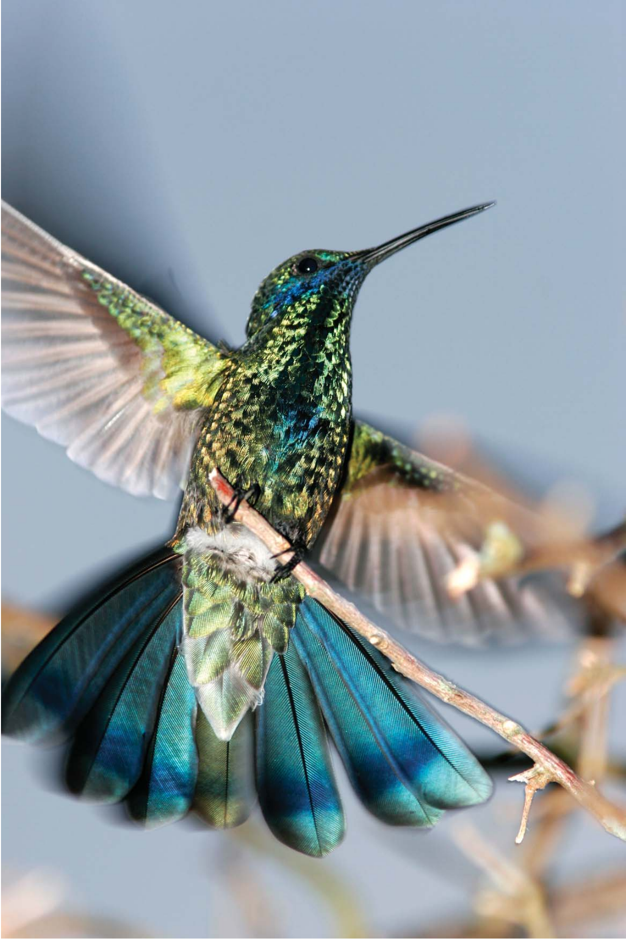
Sparkling violetear. Hacienda Zuleta. Day 5, Monday 25 April, 6:03PM.