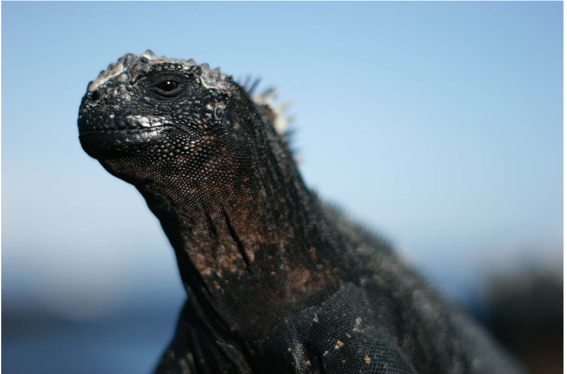
Marine iguana. Punta Espinosa, Fernandina. Day 12, Monday 2 May, 4:24PM.