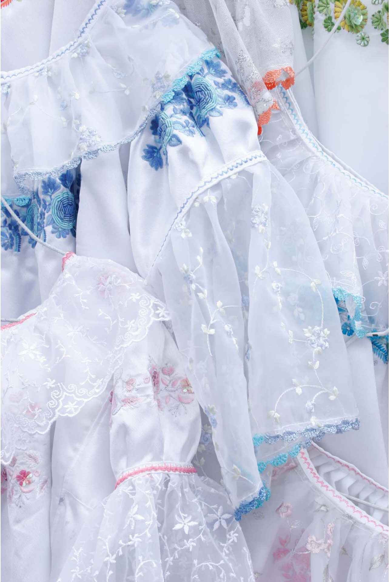
Embroidered blouses for sale. Otavalo Market. Day 3, Saturday 23 April, 11:16AM.