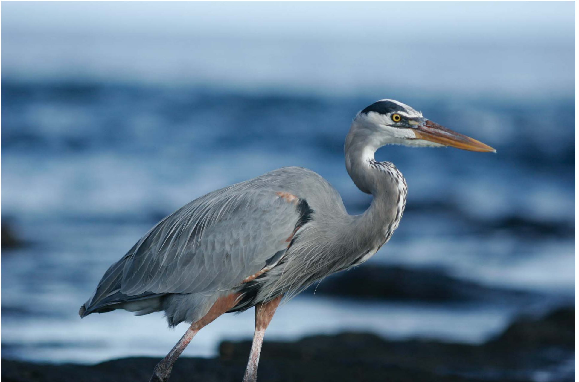
Great blue heron. Puerto Egas, Santiago. Day 13, Tuesday 3 May, 6:44AM.