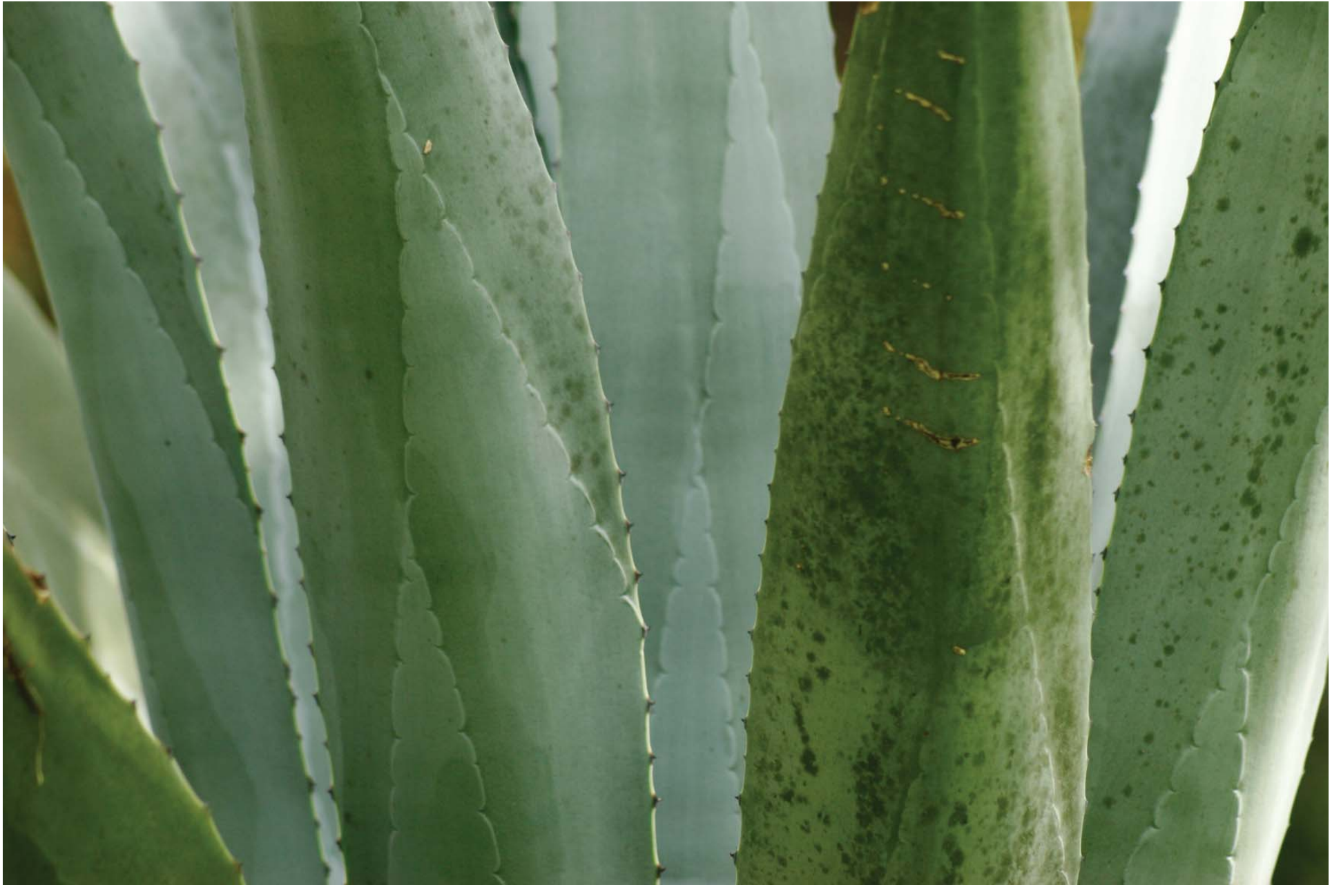
Hacienda Cusin. Day 2, Friday 22 April, 2:58PM.