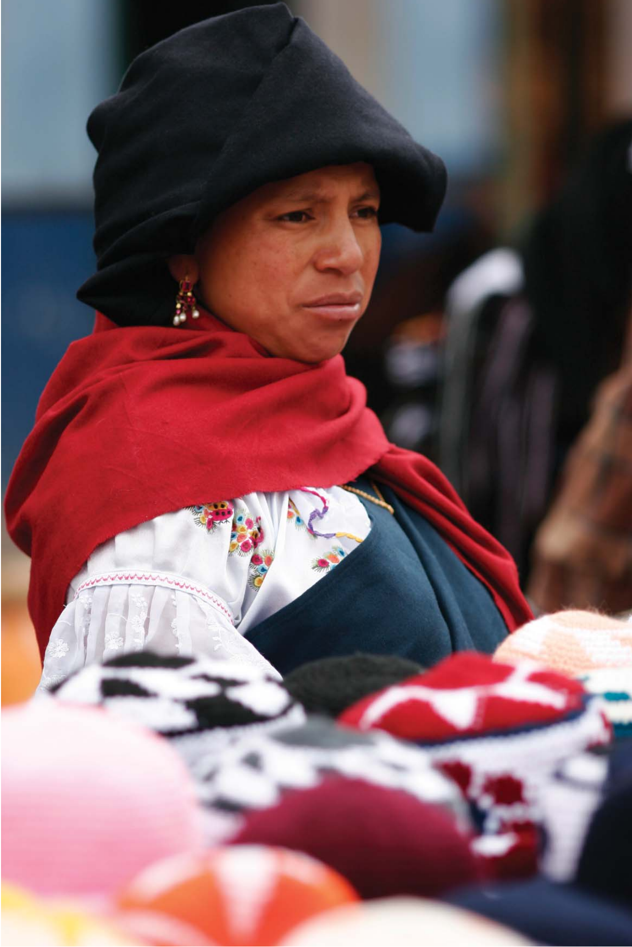
Otavalo Market. Day 3, Saturday 23 April, 9:09AM.