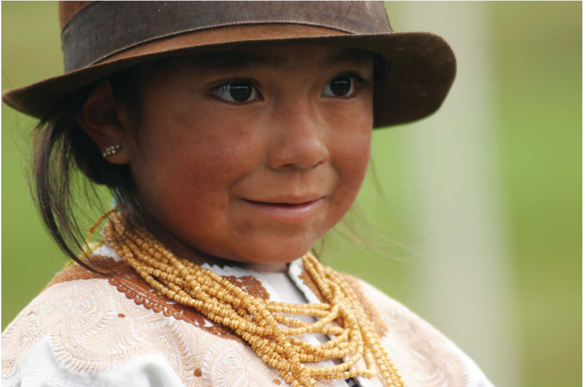
Girl by the side of the road between Zuleta and Cusin. Day 6, Tuesday 26 April, 10:49AM.