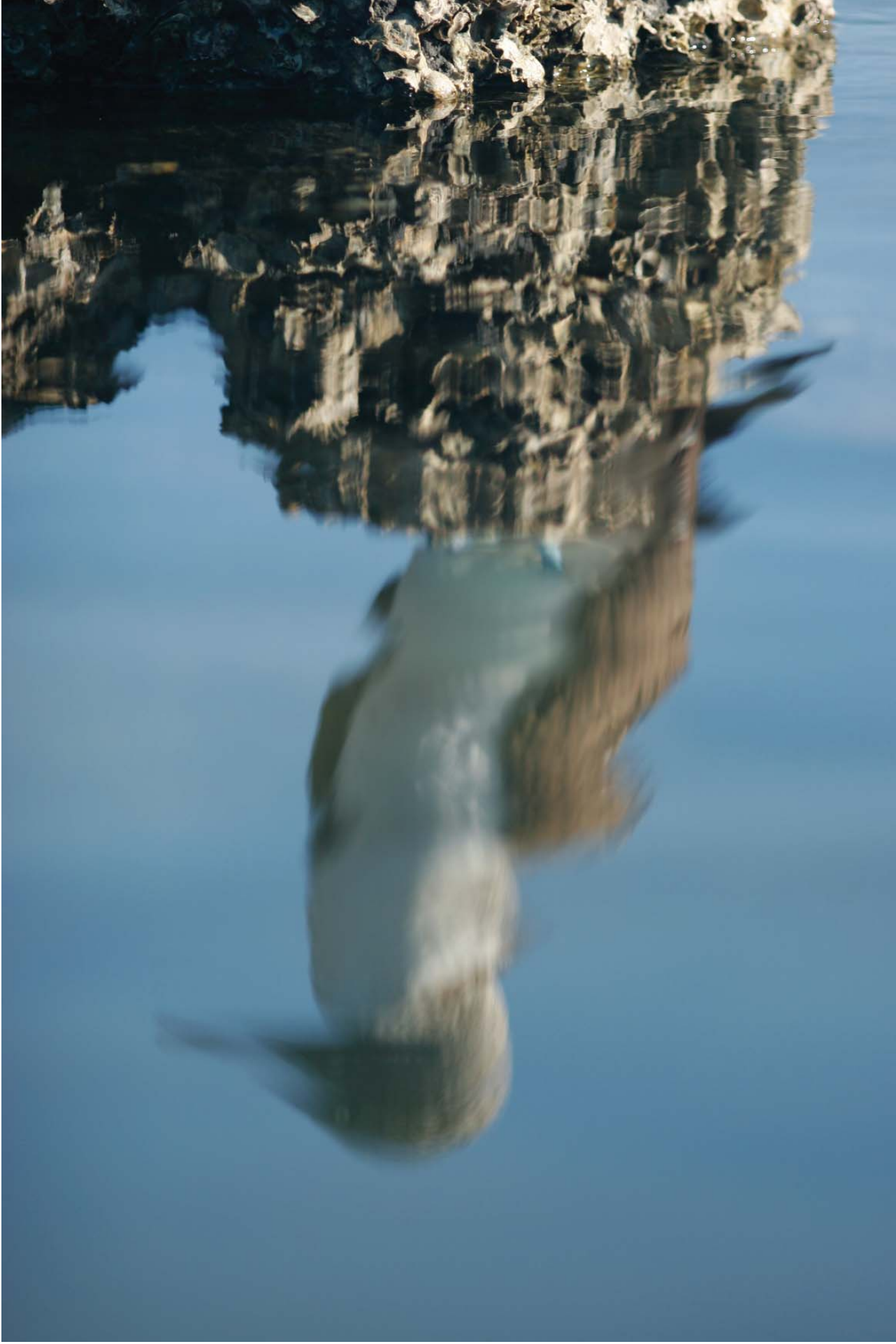
Reflection of blue footed booby. Caleta Tortuga Negra, Santa Cruz. Day 14, Wednesday 4 May, 7:34AM.