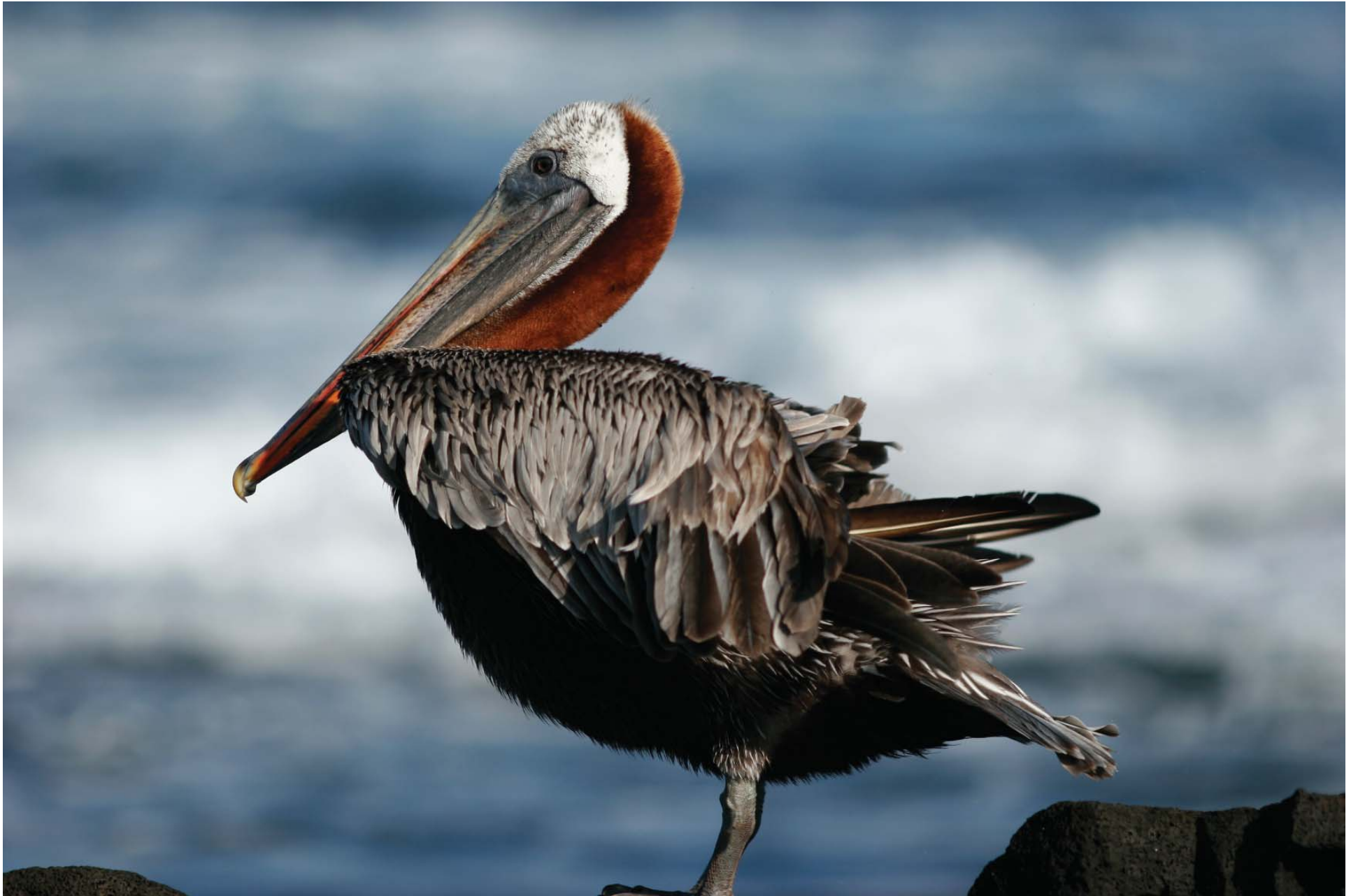
Pelican. Puerto Egas, Santiago. Day 13, Tuesday 3 May, 7:57AM.